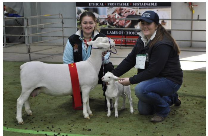
Bendigo Sheep and Wool Show 2018