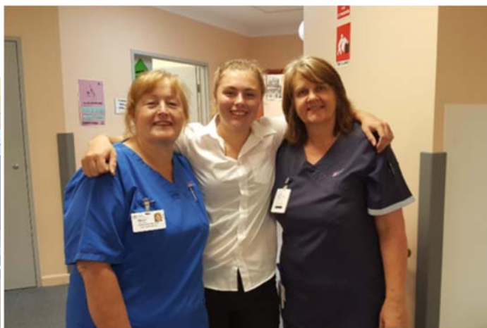
Brandy - Hay Hospital